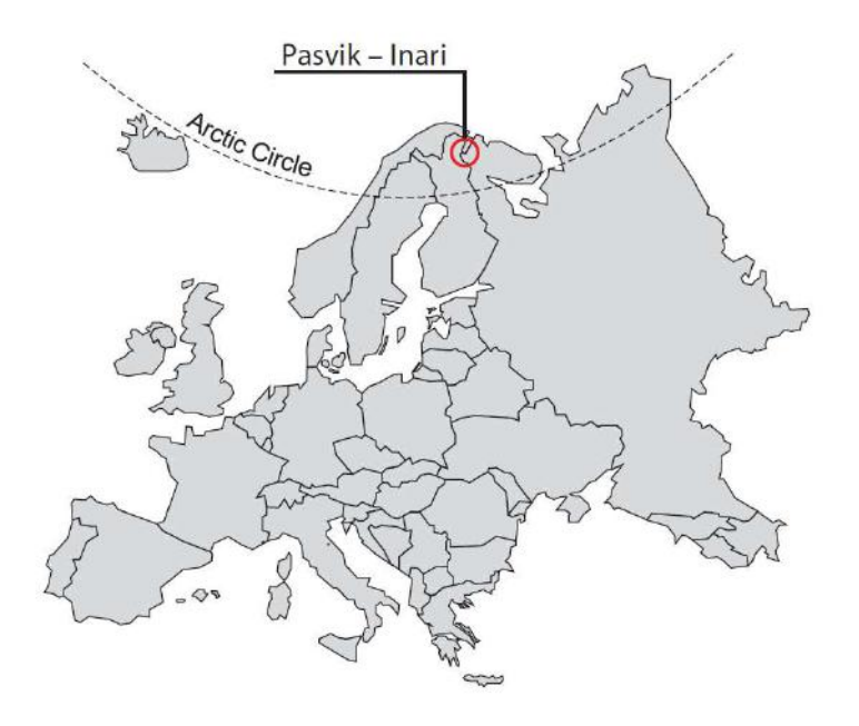
Fig 1. The Pasvik-Inari area

The lush valley of the Pasvik river stretches from the largest lake of Finnish Lapland, Lake Inari, towards the Barents Sea, along the borders of Finland, Norway and Russia. The Lake Inari area and Pasvik valley are known for their great natural and cultural values. The Pasvik river and the surrounding wilderness comprise a unique nature system where the European, Eastern and Arctic species meet. Some of these species reach here the ultimate limits of their distribution. The valley also forms a diverse habitat for various plant and animal species. In the surrounding wilderness areas, the species inhabiting the rugged, rocky wilderness are required adaptations to extreme conditions.